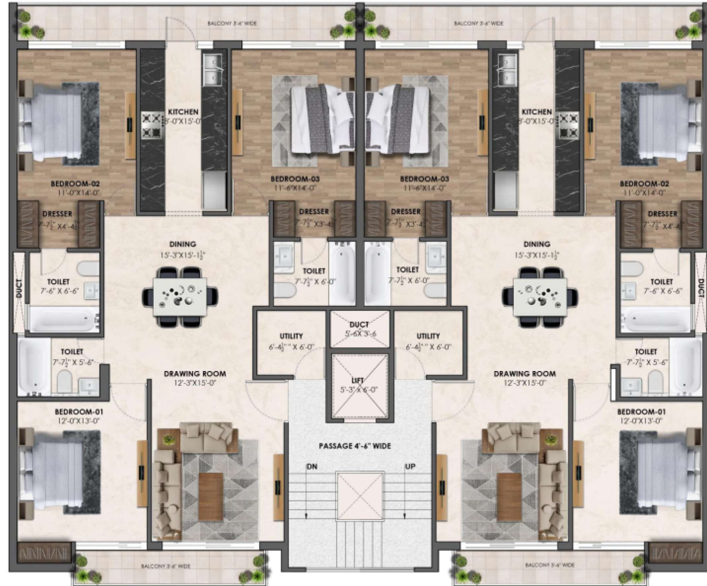
1st-3rd Floor Plan (32'x70')